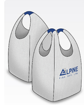
One loop/ Two loop