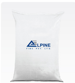
PP Woven Sack