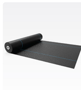
PP Ground Cover