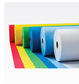
PP Woven Fabrics