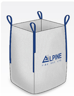
U panel/ Builder